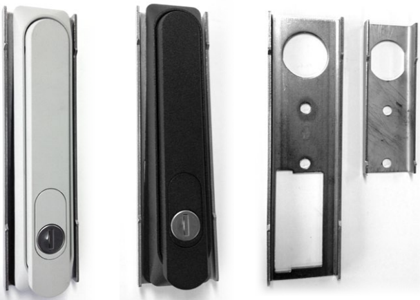
NEW COLOURS AND FINISHES AVAILABLE