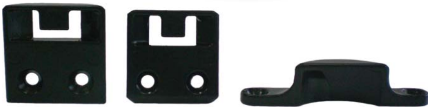
Surface mount and face fix strike options available